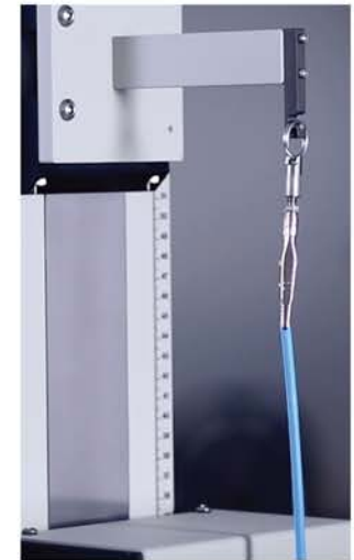
Accommodates parts from 0.3 mm - 20 mm in diameter, with lengths up to 70 cm

A test instrument dedicated to measuring the coating thickness properties of medical devices